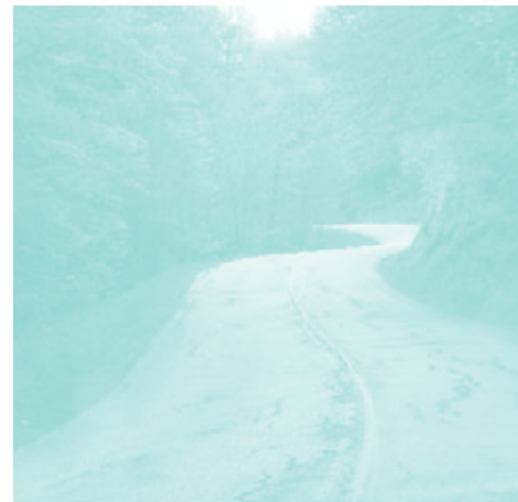
One of the interesting winding roads taking you to the next studio....